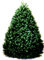
Grand Fir 6'-7': $96