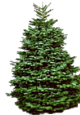
Noble Fir 6'-7': $96