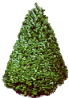
Douglas Fir 4'-5': $56 6'-7': $66

** The profit margin increases with the total volume in sales.** By selling two trees per child, we can potentially reach our entire FWS goal!