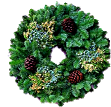
Wreath 20'': $25