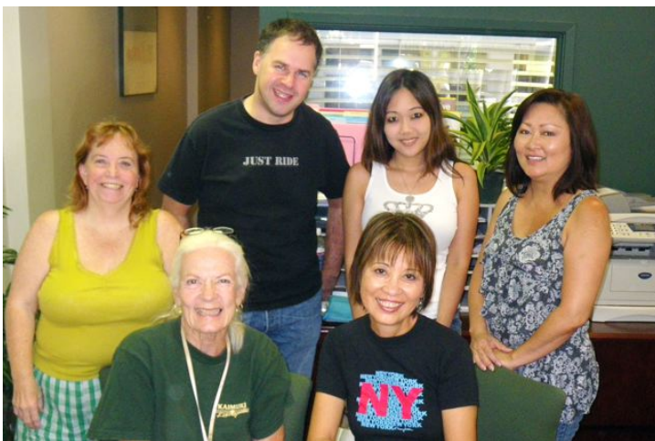
Pictured here is the East Honolulu Rotary Dictionary Project Labeling Crew --- they put the label of the Rotary 4-Way Test on the front inside cover of the dictionaries that are to be distributed. MAHALO to the crew!