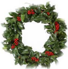
Create a beautiful Wreath for the holidays December 5