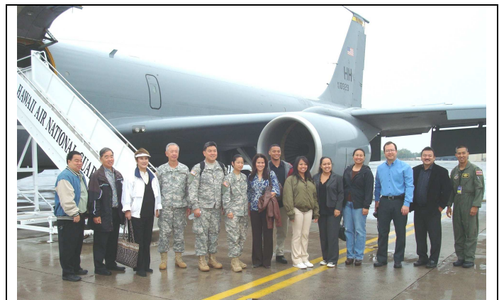
Legislators were invited on a two-hour re-fueling flight with the Hawaii Air National Guard on a K135 tanker