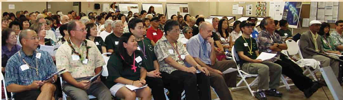
Attendees at the opening program in Monsanto's new Kunia facility.

After months of planning and preparation, a glorious sunny day greeted more than 200 people at the second Honouliuli Pilgrimage titled Honouliuli National Historic Site: Dream or Reality? The event was co-sponsored by the Cultural Center, the Japanese American Citizens League—Honolulu Chapter, Monsanto Hawai'i, and the Honolulu Japanese Junior Chamber of Commerce.