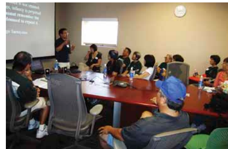
One of the many breakout sessions held at the event.