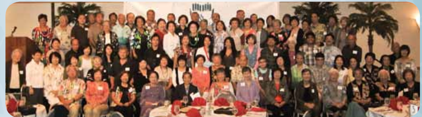
The Cultural Center's dedicated volunteers pose for a group shot at the annual luncheon held on June 20.