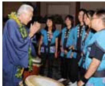
(left) Dr. Genshitsu Sen chats with the members of Shinnyo-En Taiko. (below) This year's silent auction featured more than 200 items including a wide variety of sake.