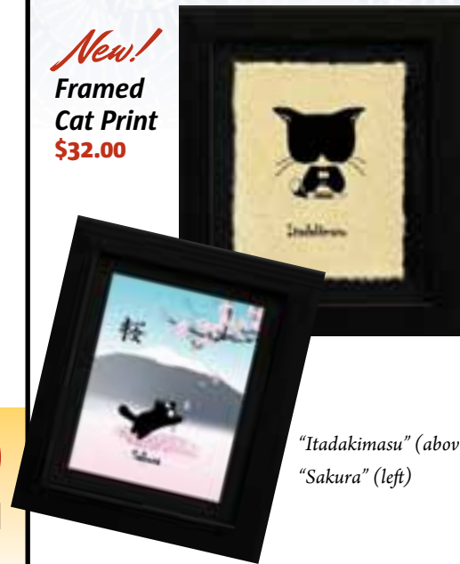
"Itadakimasu" (above) "Sakura" (left)