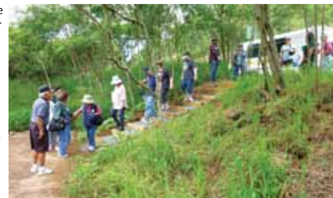
2011 Day of Remembrance Honouliuli Pilgrimage

The first JACS grant the Cultural Center received came in 2009 in the amount