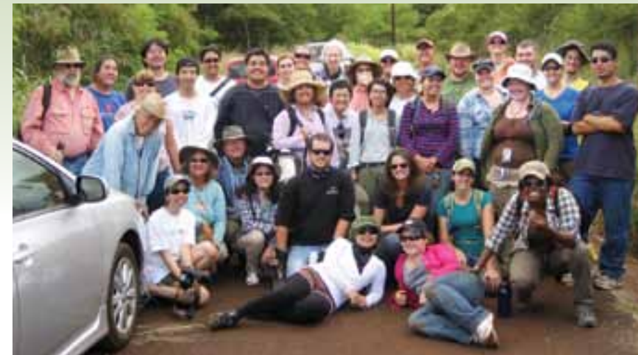
On July 14, a group of about 40 students from the University of Hawai'i at Mānoa, University of Hawai'i-West Oahu, and Cultural Center volunteers ventured into Honouliuli to look for a second guard tower.