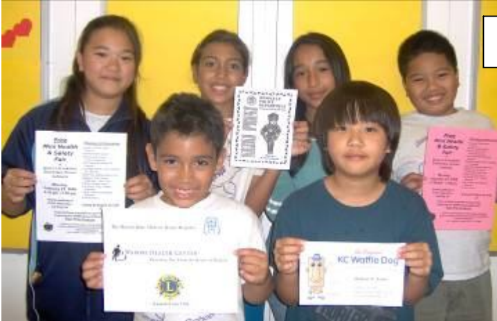
Health & Safety Fair – February 25, 2008