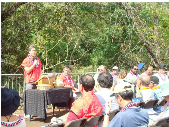
Honouliuli Internment Camp Revisited