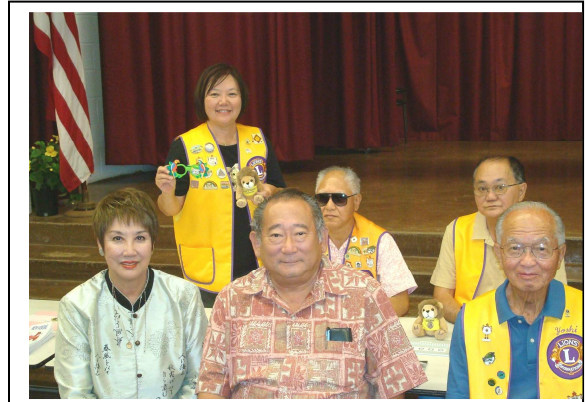
Kaimuki Lions booth at the Lili'uokalani Health & Safety Fair

Also the A Building will be re-roofed at Kahala Elementary, 18 th House District.