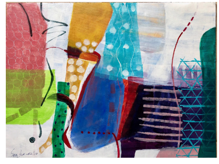
Artwork by Sara Yukako

August 5 - 28, Honolulu Hale Courtyard Reception on August 8, 4 - 6 pm at Honolulu Hale Courtyard