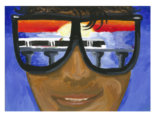
Artwork by Joshua Kaliko

The Honolulu Authority for Rapid Transportation will display the winners of their 2019 Honolulu Rail Transit Project Art Poster Contest. This year's theme was "Imagine Yourself: Ready to Ride."