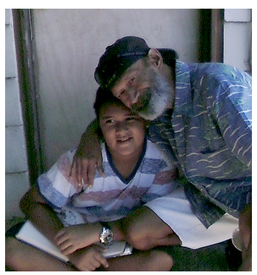
Detail of Reunited With Family by Ernest, 60