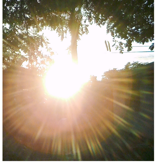
Detail of Promise of A New Day by Anonymous Female, 35

Honolulu Hale Courtyard, 530 S King St, M - F, 8:00 am - 4:30 pm Presented by the Institute for Human Services, the University of Hawai'i at Mānoa and the City and County of Honolulu's Department of Community Services.