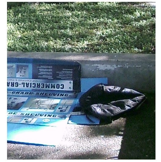
Detail of This Is Not A Posturepedic Moment by Thomas, 55