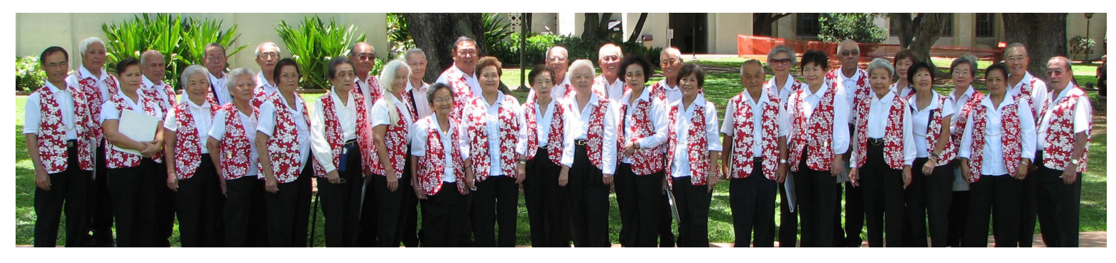
Small World Harmonica Band, Beretania Community Park Recreation Center, Honolulu, Hawai'i