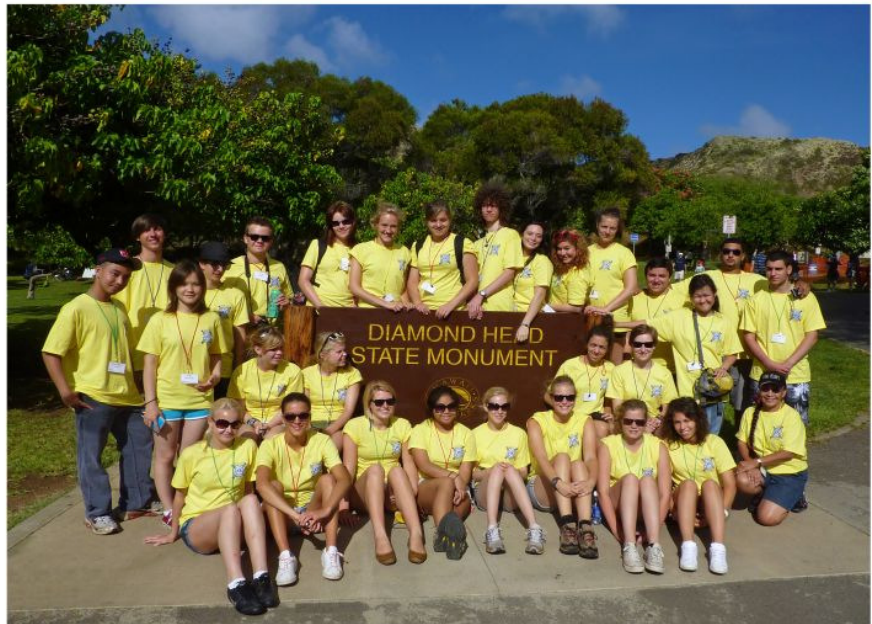
HAWAII LIONS 2011 INTERNATIONAL YOUTH CAMP DIAMOND HEAD HIKE