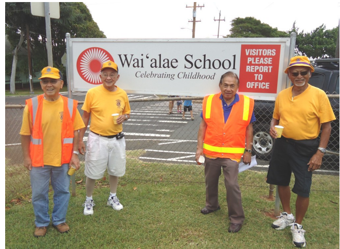
Kaimuki Lions volunteered at the Wai'alaie Charter School Fair and honored JPO students at Paradise park