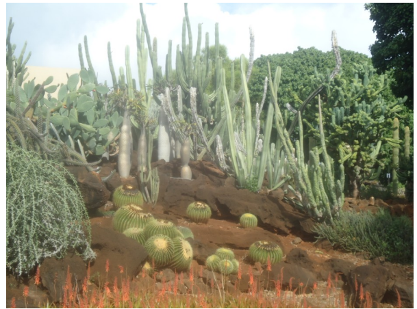
Where is this? The cactus garden with super-sized saguaro is located on the KCC campus. Drive by; it is visible from the Diamond Head parking lot.