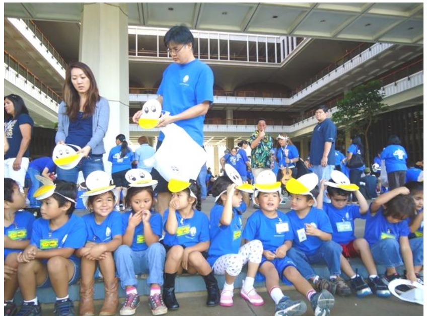
Hundreds of adorable Pre-Schoolers filled the Capitol rotunda to emphasize the importance of the role Good Beginnings Alliance is in preparing children for elementary school and for life.