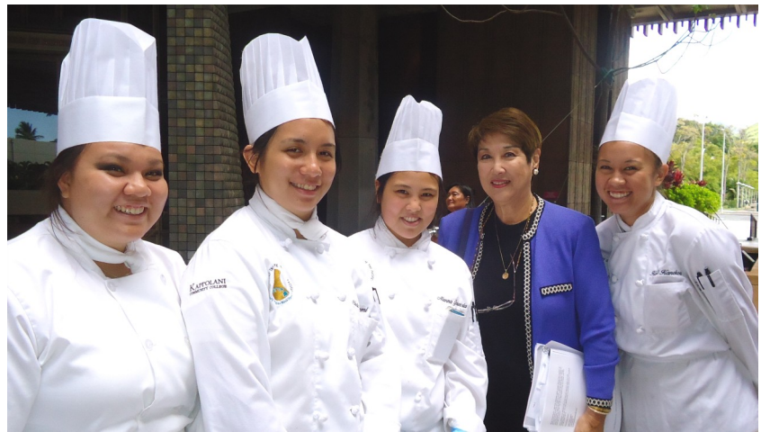
KCC participates in Education Week at the Capitol – KCC Culinary and several chefs-in-training provided Capitol workers with sliders and fish and local veggies. UH Manoa football coaches were also present.

A Marumoto concurrent resolution passed asking Congress to establish a Women's Museum. Another resolution introduced by Rep. Marumoto also passed calling for the Department of Health to set up a plan to tackle COPD (Chronic Obstructive Pulmonary Disease). A Kahala bill, the dog inspection bill and an ATV safety bill are still alive (as of April 4) in the Senate. The East Honolulu Fishpond preservation provision was stripped from HB2820.