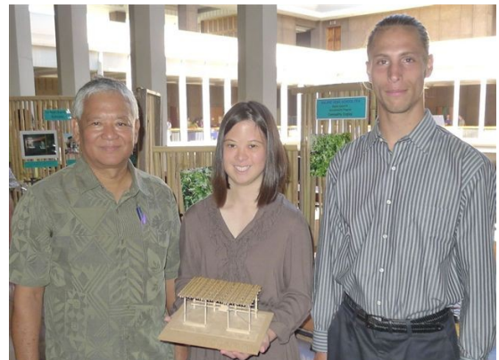
Kalani High Sustainability Project exhibit for Education Week.