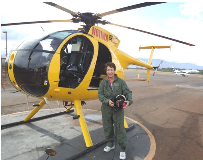
Finance Committee members observed the miconia eradication program from helicopters above Hana, Maui.