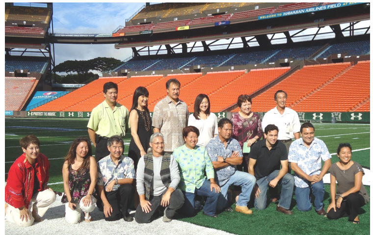
Stadium staff briefed legislators on recent safety and structural improvements.

See the new exhibit at Bishop Museum, Tradition & Transition , featuring stories of Hawaii Immigrants. The first phase features documents and artifacts of Japanese immigrants collected by the non-profit Hawaii Imin Preservation Society (Shiryo Hozon Kai) and housed for safekeeping at Bishop Museum since the onset of World War II. Rep. Marumoto serves on the board of the society. Another reception was hosted by the US – Japan Council and the APEC Host Committee . On hand were Sen. Dan Inouye, the Japanese Premier and Foreign Minister, the US Secretary of Commerce John Bryson and many other dignitaries. Secretary Bryson said that he spent a year at Kaimuki Middle School many years ago. The 100 th Infantry Battalion Veterans dedicated an educational display at the 442nd RCT Clubhouse .