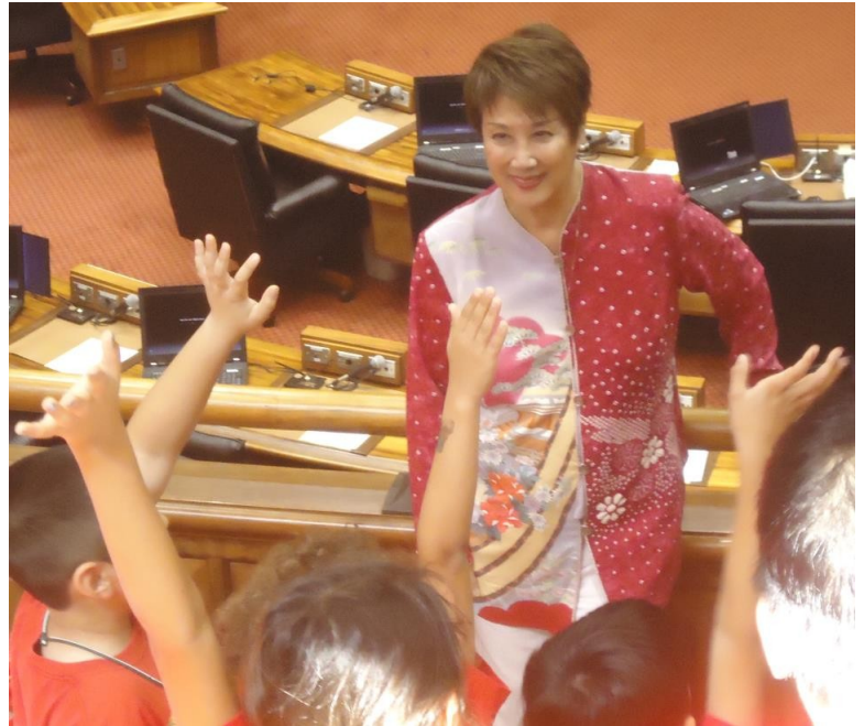
Kahala School Visits Capitol – 80 5 th graders came prepped to asked questions about state government.