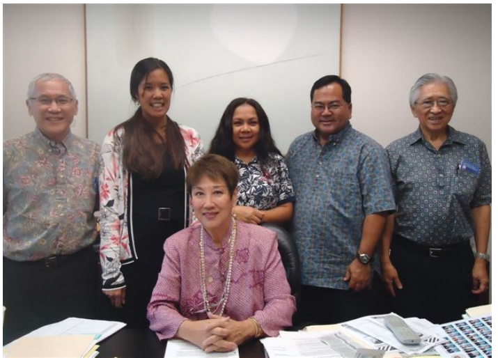
Members from the General Contractors Association visited legislators to explain their legislative priorities.