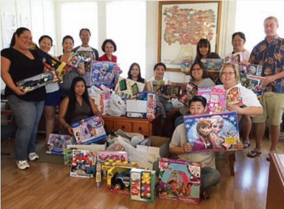
A huge Mahalo to CPB HR Department for organizing a toy donation towards our Laughter Wagon!