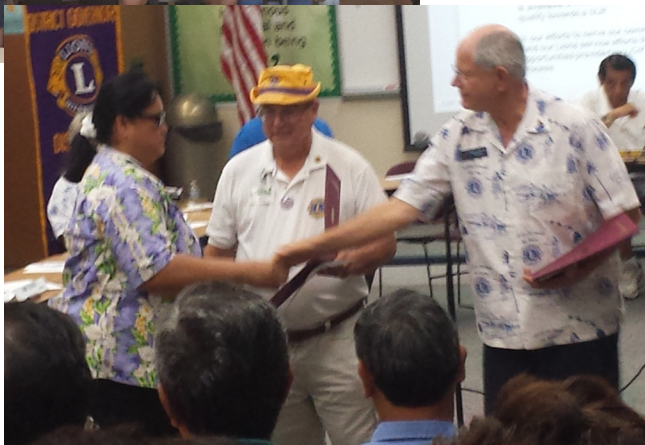
< Vision Pin Award at D50 Cabinet Meeting